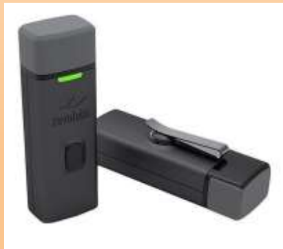
Wearable lapel style mic for teacher

This MyEdChoice classroom is set up with special equipment to allow the students and instructor to have the best experience possible when using video conferencing.